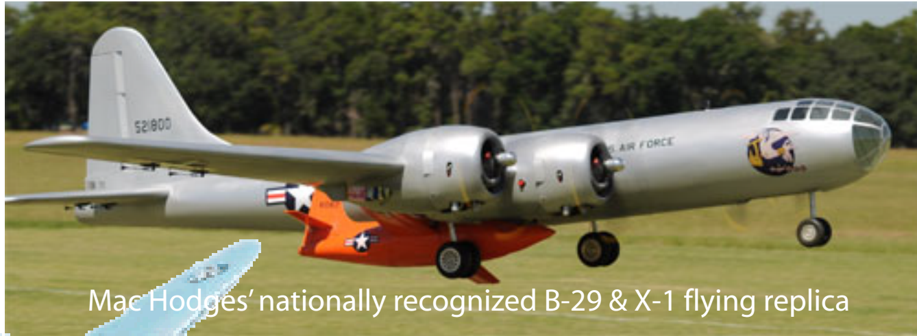
Mac Hodges' nationally recognized B-29 & X-1 flying replica